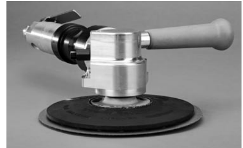
Front view of 4520RA/4527/4620RA/4627RA Series Tools

The tools listed in this chart will be provided with an aluminum housing. Steel housing material is available. See information below for the entire spectrum of options available.