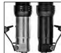
Aluminum Case Steel Case