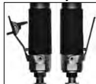
Safety Lever Standard Lever