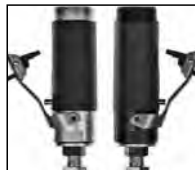
Aluminum Case Steel Case