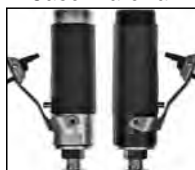
Aluminum Case Steel Case