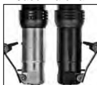
Aluminum Case Steel Case