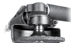
Type 27 or Type 27 Cut-Off (Type 42) Wheel