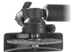
Type 1 or Type 1 Cut-Off (Type 41) Wheel